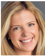
ANNIE LANE Creators Syndicate Inc.