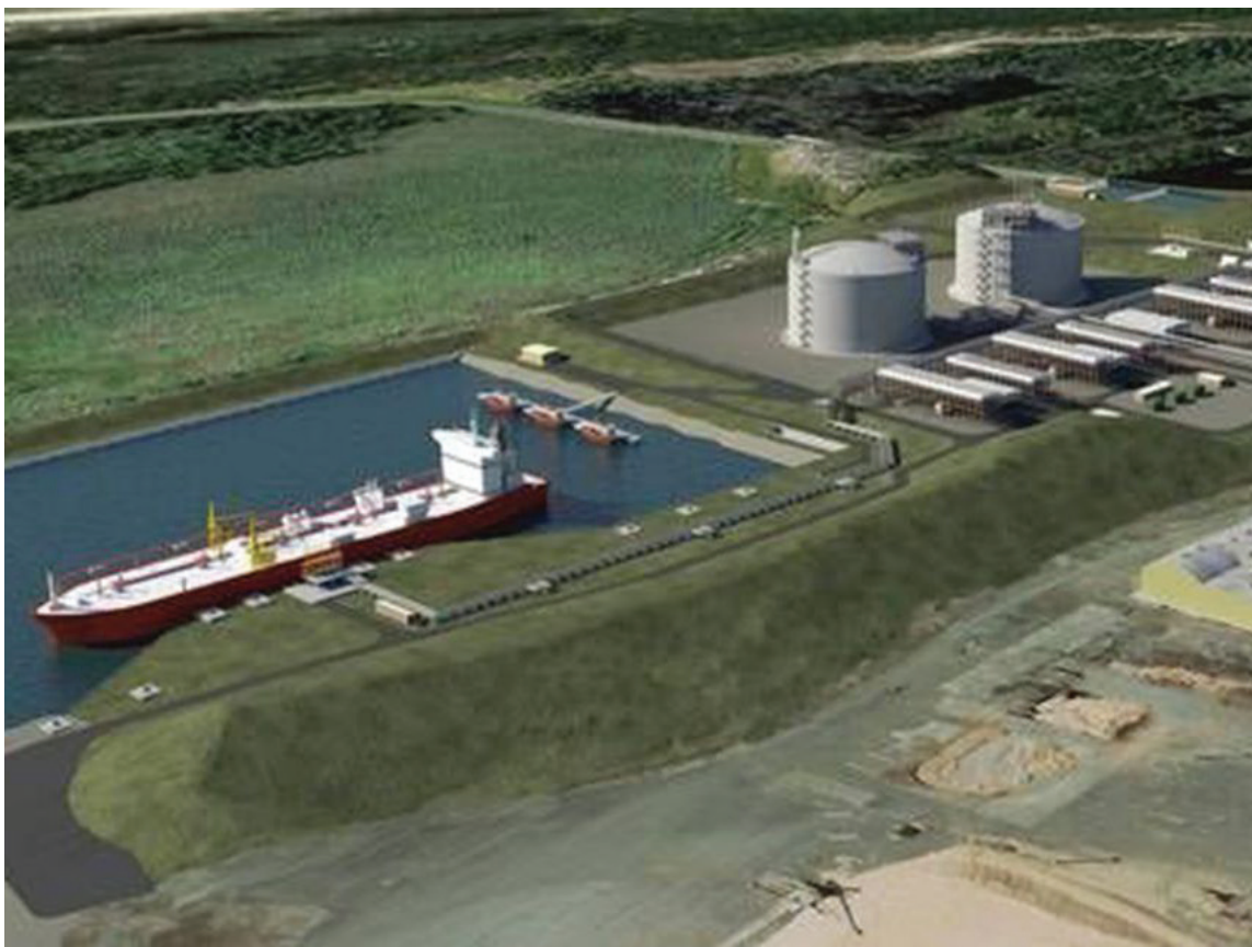
A rendering of the proposed Jordan Cove liquefied natural gas terminal in Coos Bay.