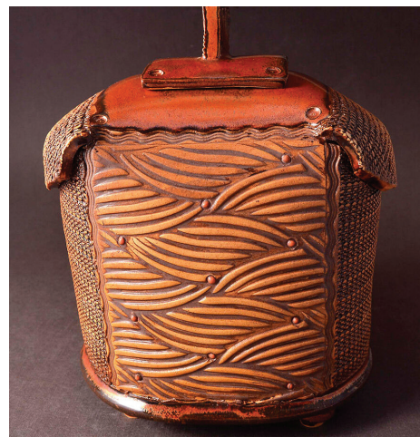
A 'woven samurai vessel,' created by Tom Bottman.