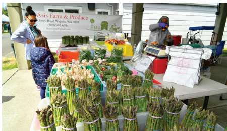
The Ilwaco Saturday Market will run through September.

North Coast Food Web's Small Farms Market Day runs weekly. Customers order food and plants before Tuesday at midnight. Items are available for pick-up in Astoria on Thursdays or via delivery.