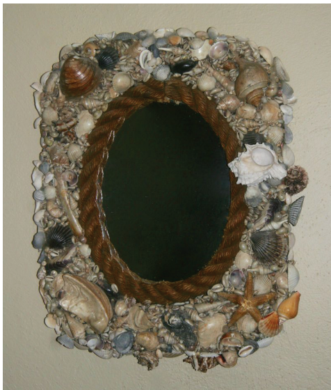
A vintage shell mirror, featured by Pacific Heirloom and Collectables.

Featuring a collection of shell-crusted mirrors, including seashells and oyster shells. Vintage and luxury coastal shell-inspired designs and décor are also featured.