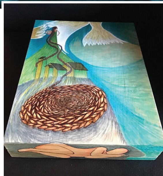
TOP: Copper art by Don Dye, featured by TigerLily Gallery.