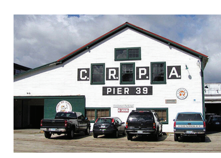
The Hanthorn Cannery Market at Pier 39 will feature a variety of vendors.

Among the activities at Pier 39 is the Hanthorn Cannery Museum where visitors can learn about the history of the former Bumble Bee Seafoods cannery while locals enjoy a stroll down memory lane. The museum also sells an assortment of souvenir items, with proceeds benefiting the Hanthorn Cannery Foundation.