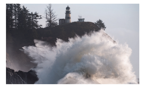
Large waves crash at Cape Disappointment near Waikiki Beach during King Tides.

Remaining free days are June 5, June 12, June 13, Aug. 25, Sept. 25, Nov. 11 and Nov. 26.