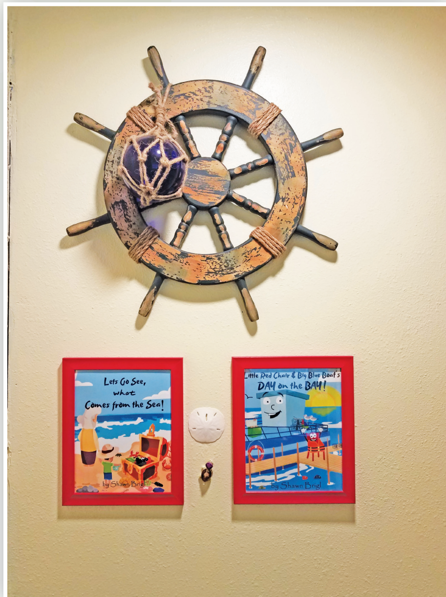
The covers of two of Shawn Brigl's books hang on a wall.

W hen it comes to storytelling, Nehalem author Shawn Brigl finds inspiration daily.