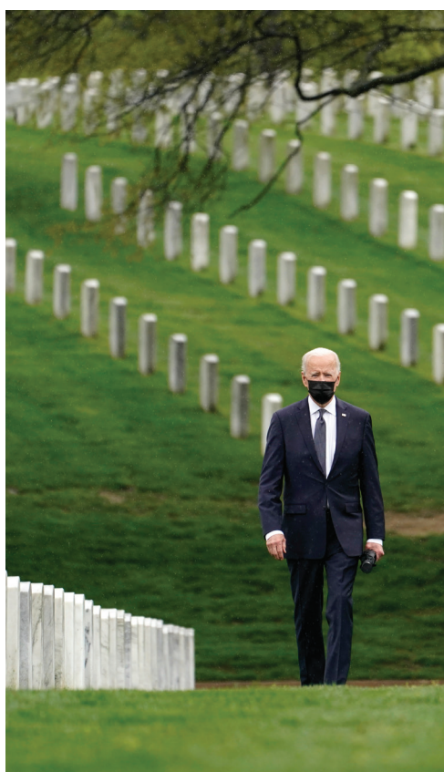
President Joe Biden visited Arlington National Cemetery in Virginia on Wednesday after announcing the withdrawal of the remainder of U.S. troops from Afghanistan by Sept. 11.

“This administration has decided to abandon U.S. efforts in Afghanistan which have helped keep radical Islamic terrorism