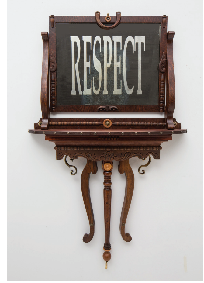
'Self Respect' by Dan Pillers, shown by RiverSea Gallery.