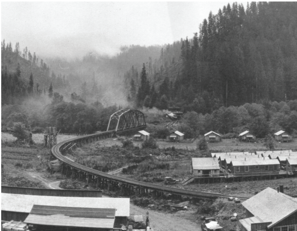
Nehalem River Ranch is one of many photographed spots in Mark Beach's book.