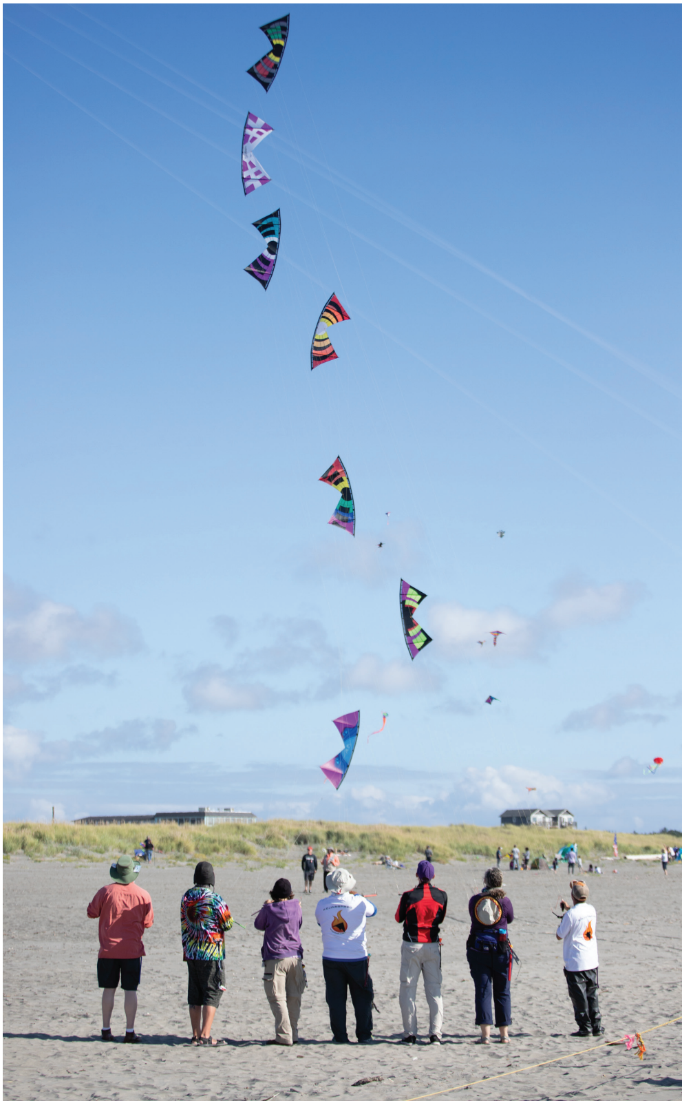
People fly kites during the Washington State International Kite Festival.