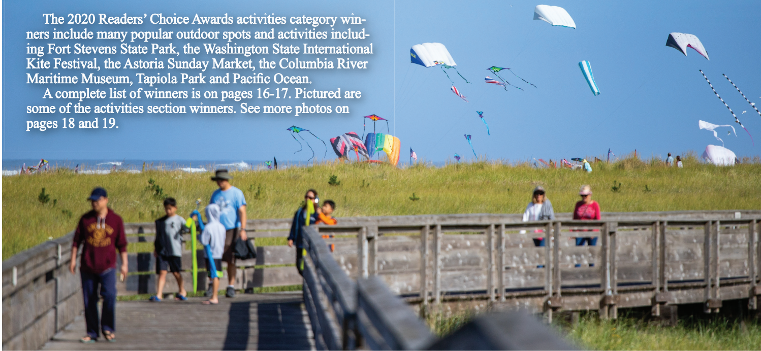
People walk along the Long Beach Boardwalk during the Washington State International Kite Festival.

A complete list of winners is on pages 16-17. Pictured are some of the activities section winners. See more photos on pages 18 and 19.