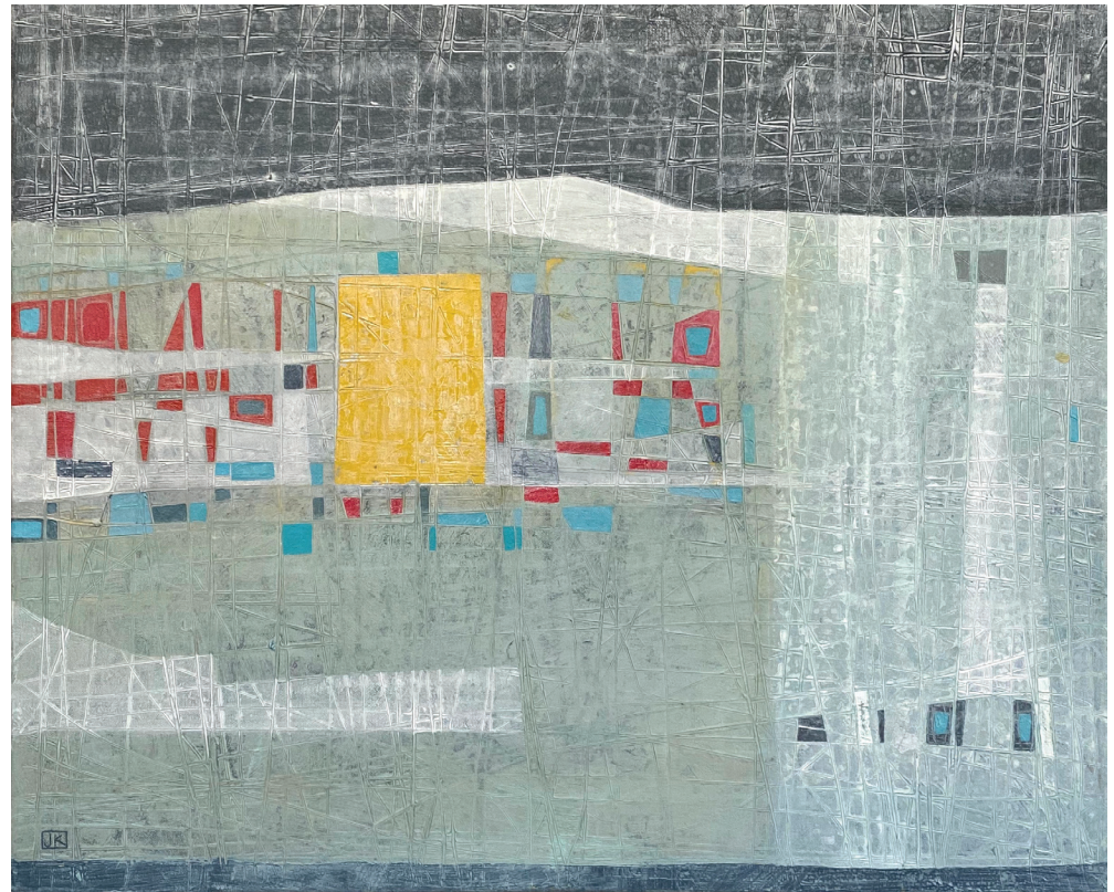
Jody Katopothis' 'The Old Neighborhood,' featured by Imogen Gallery.