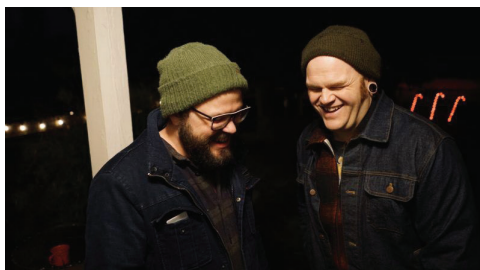
Left Coast Country

The show is appropriate for all ages and is free to watch.