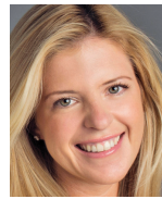
ANNIE LANE Creators Syndicate Inc.