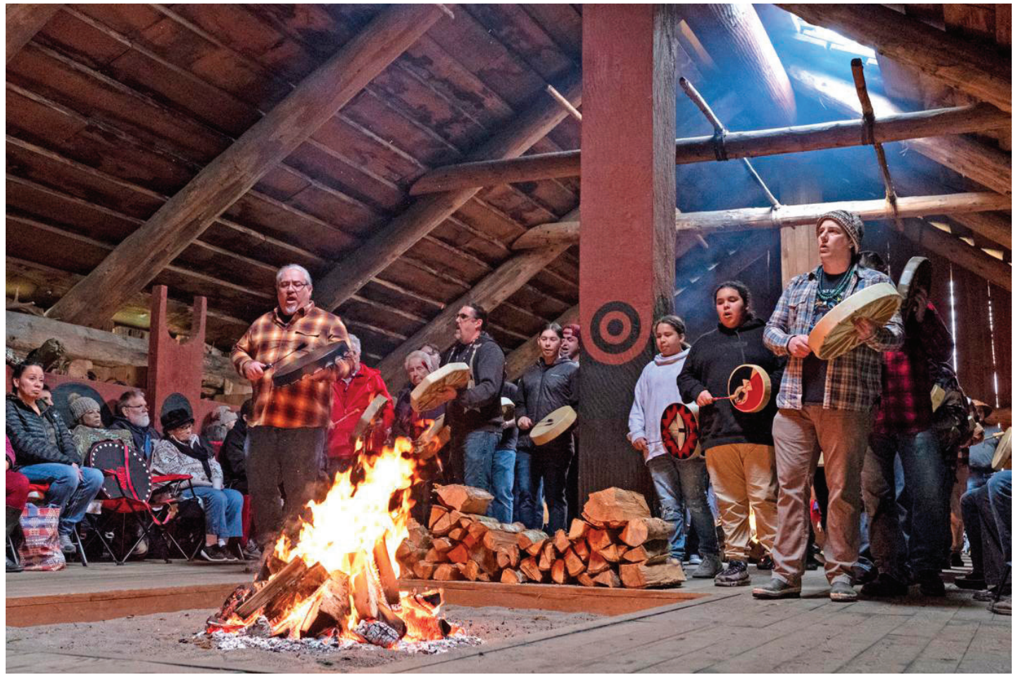
The Chinook Indian Nation and guests held their winter gathering last year at the Cathlapotle Plankhouse on the Ridgefield National Wildlife Refuge.

For reasons too messy to describe, in the mid-19th century the Chinook Indian Nation was left out of the process of recognizing tribes, settling land claims and providing compensatory rights and benefits. After decades of struggles, the tribe achieved federal acknowledgment at the very end of the Clinton administration, only to see it revoked by George W. Bush's Bureau of Indian Affairs. Justice remained on ice