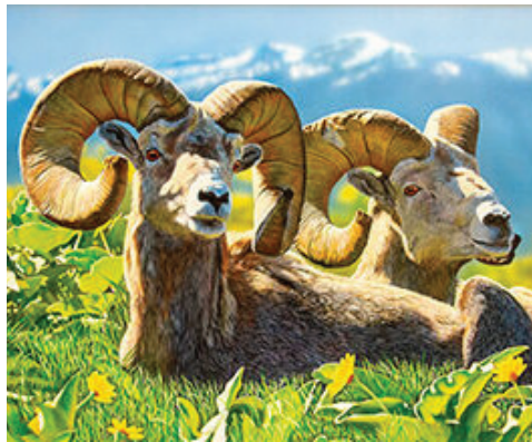
The 2021 Habitat Conservation Stamp, created by Buck Spencer.

test rules is online at dfw.state.or.us/stamp_contest/ .