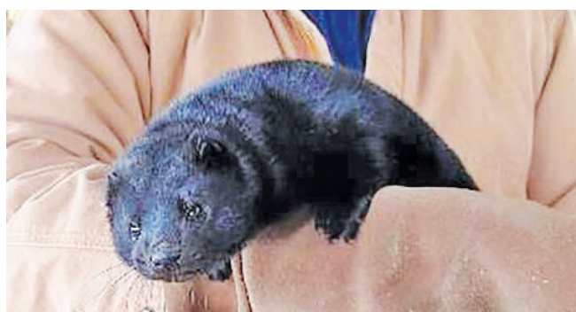
Fur Commission USA

Since the initial positive tests, the Department of Agriculture has conducted two rounds of follow-up testing