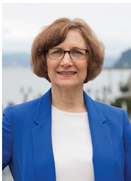
U.S. Rep. Suzanne Bonamici, a Democrat, serves the 1st Congressional District.

Bonamici was also among the lawmakers to forcefully speak out