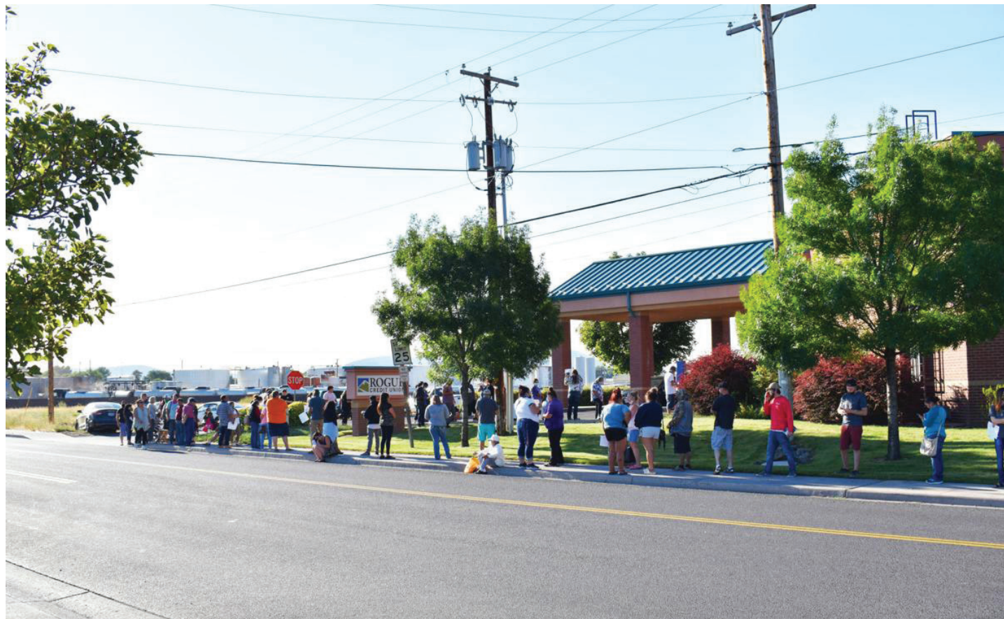
People wait for their checks outside a credit union in Klamath Falls.