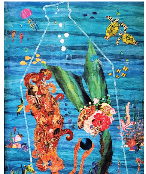
The raffle tapestry, ‘Secrets of the Siren.’

The winner will be announced on Sept. 13 at the Lewis and Clark Salt Makers event.