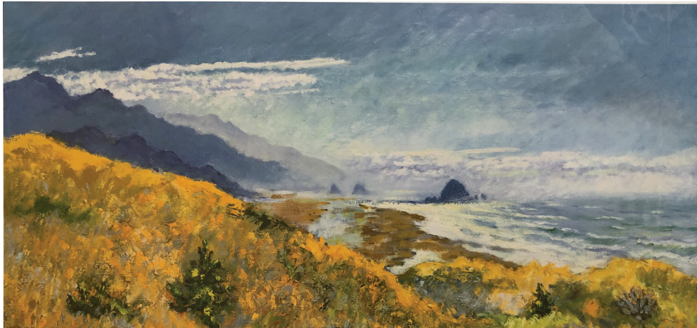
The Frederick Dwello piece up for auction.

CANNON BEACH — The Cannon Beach History Center & Museum is selling raffle tickets for a fundraiser.