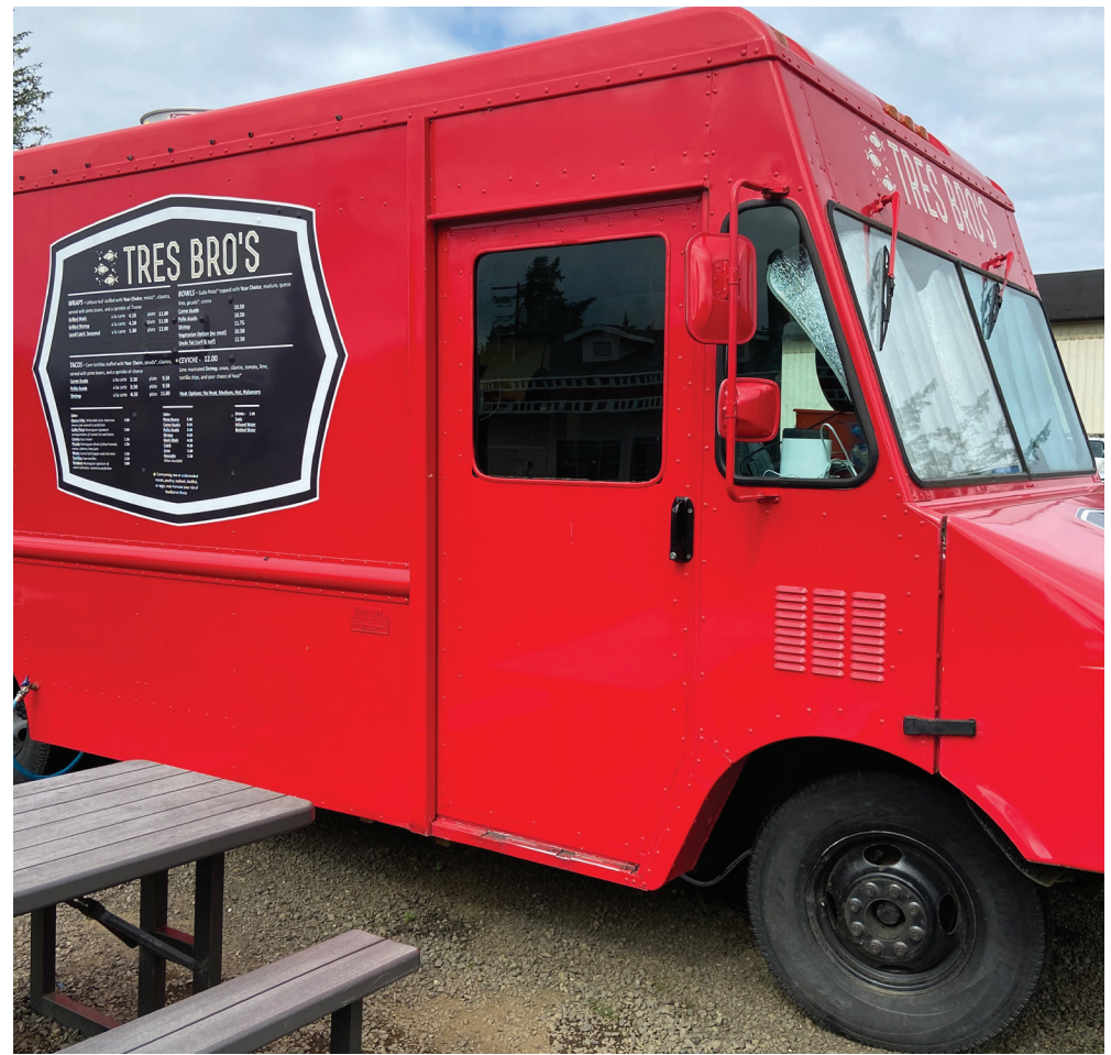
Tres Bro's serves food from a bright red food truck located on Main Avenue in Warrenton.

See Page 14 A burrito from Guadalajara Combo.