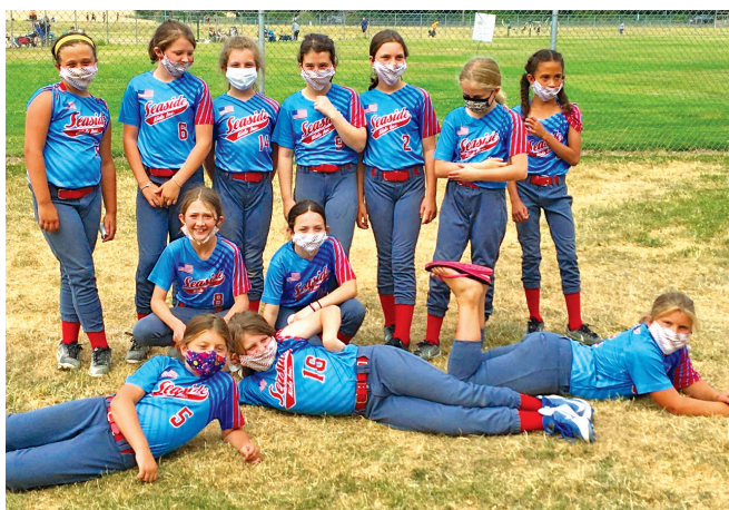
The Seaside Kids 10U softball team, which took part in the nationals tournament last week in Newberg.

That would be Astoria's lone run of the game, as the Jayhawks scored four runs in the second, added one in the third and broke the game open with four more in the fourth inning.