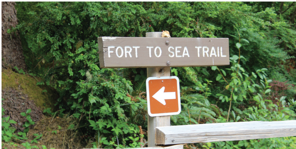
The Fort to Sea Trail leads from Fort Clatsop to Sunset Beach following the route members of the Lewis and Clark Expedition possibly used during their encampment in 1805 to 1806.