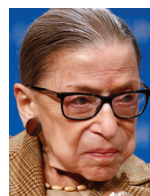
Ruth Bader Ginsburg

WASHINGTON — Justice Ruth Bader Ginsburg said Friday she is receiving chemotherapy for a recurrence of cancer, but has no plans to retire from the Supreme Court.