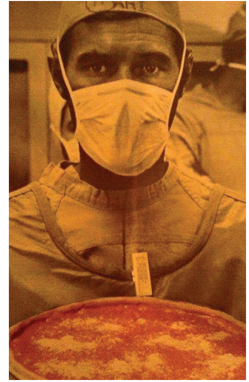
'Delivery' by Sid Deluca.