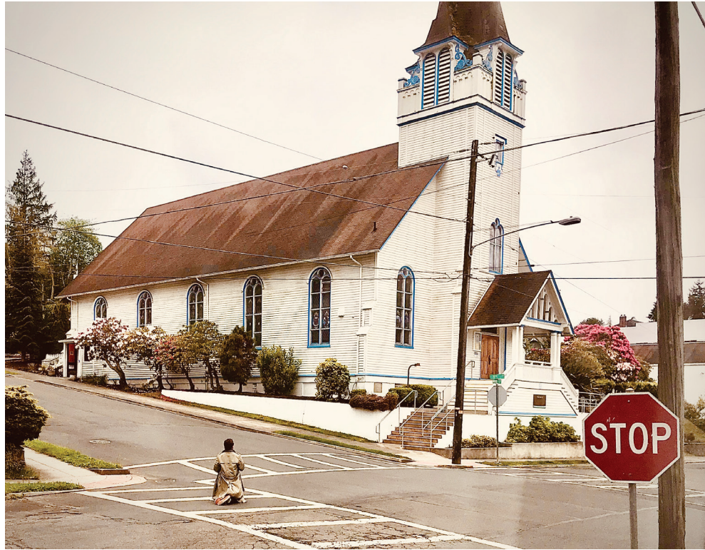
See Page 4 'Desperate Times' by Erika Olsen.

Eskelin is impressed by the variation of the collection. The call for art appealed to a