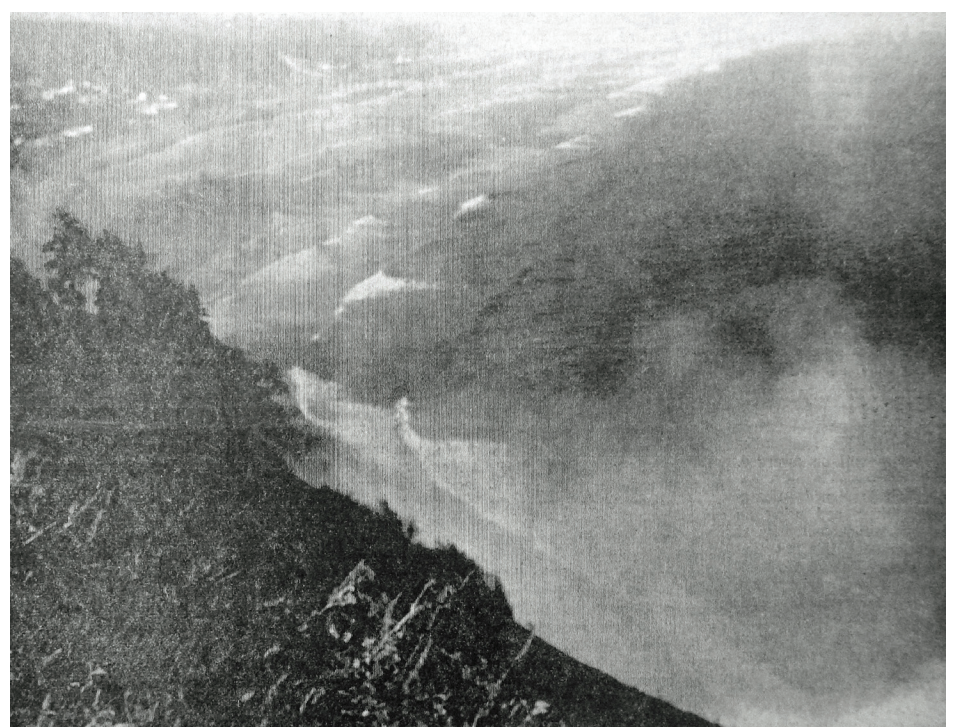
Smoke from the lower Neah-Kah-Nie Mountain fire billows in 1970.