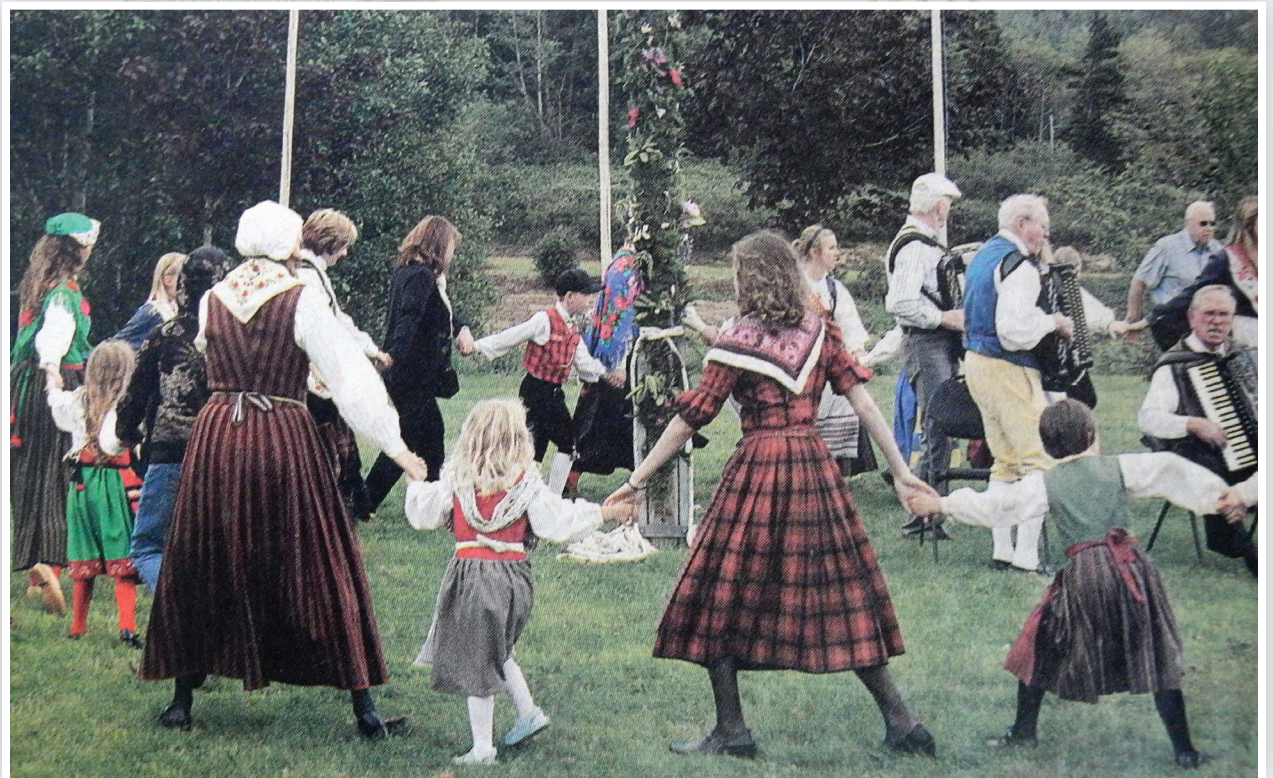
People dance around the maypole at the Astoria Scandinavian Midsummer Festival in 2010.

They are among 18 college students selected for the summer work, which will involve patrolling nearly 300 miles of Oregon coastline, some 170 of which will be closed to vehicular