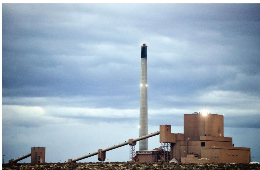
The Portland General Electric coal-fired power plant in Boardman is expected to close in 2020.