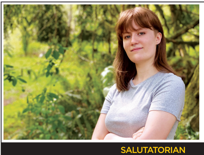
Amber Dewees Continuing Education: Portland Community College