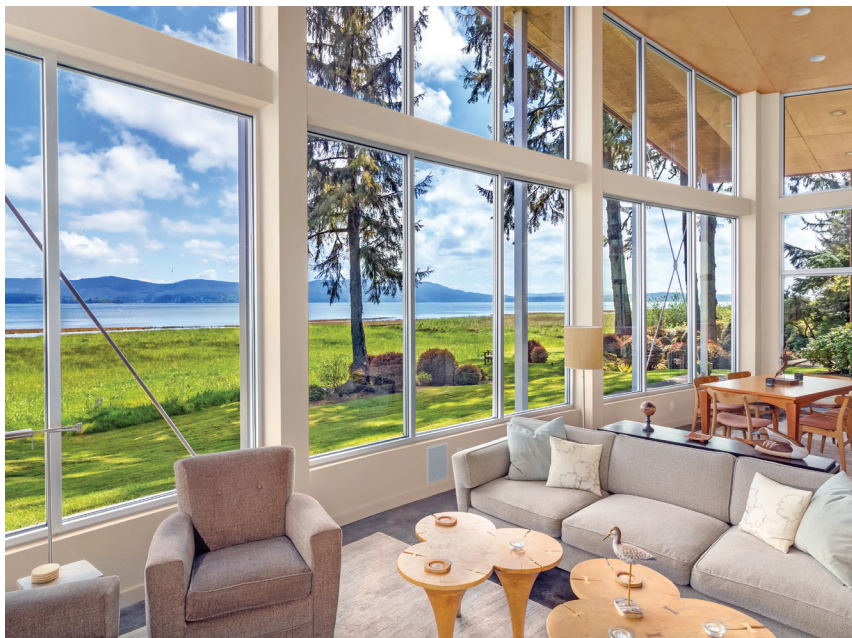
15550 Sandridge Road, Long Beach, WA $1,350,000

The duality of a horticultural nature and architectural nurture creates a serene and trance like experience in an arboreal setting on treasured Willapa Bay.