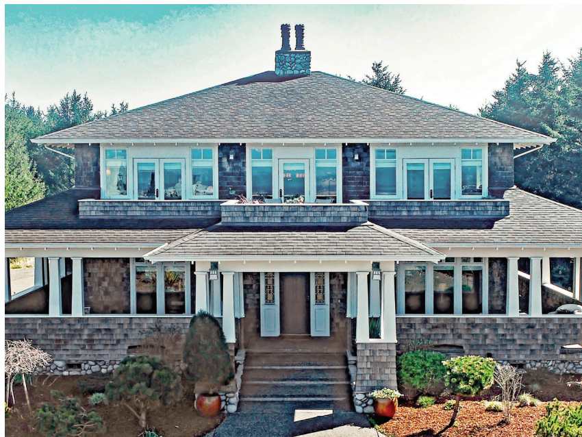
15402 J Place, Long Beach, WA $945,000

The duality of a horticultural nature and architectural nurture creates a serene and trance like experience in an arboreal setting on treasured Willapa Bay.