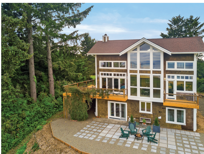
29736 Sandridge Road, Oysterville, WA $859,000

In gated Butterfly Shores, a splendid artistic endeavor, a true craftsman design includes romantic wrap around porch for seaborne Pacific salt air, & sunsets!