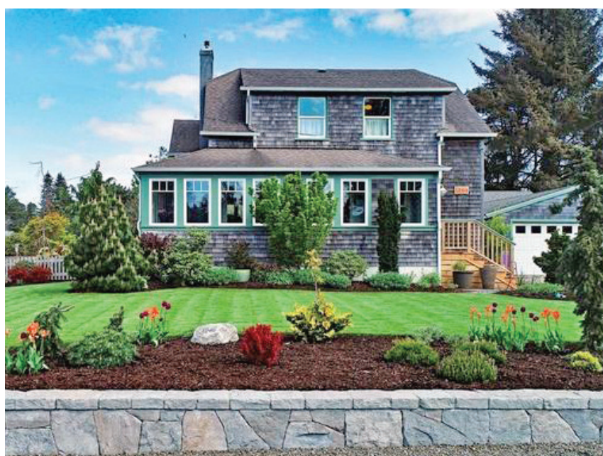
1203 33rd Street, Seaview, WA $525,000

Cultivate oysters and steamers on 350ft of private agricultural tidelands attached to this estate located within a gated enclave of 3 charming Willapa Bay homes.