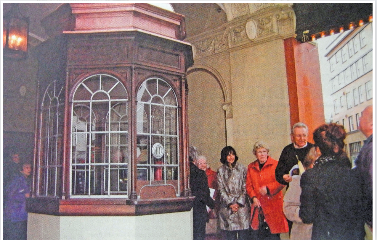
Community members gather for the unveiling and dedication of the newly restored Liberty Theater ticket kiosk in 2010.