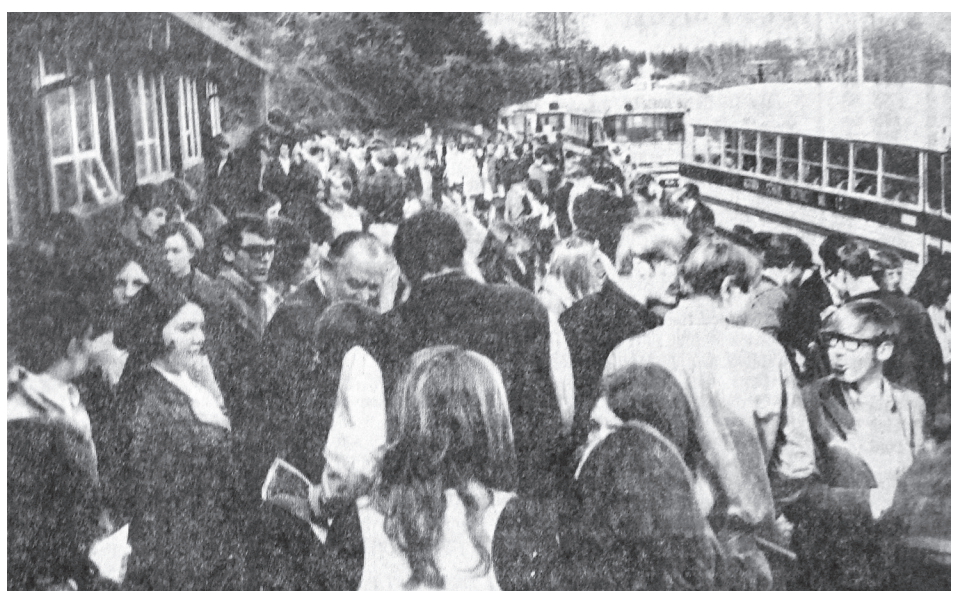
A mass of high school students visit Clatsop Community College's 'Expo 70.'