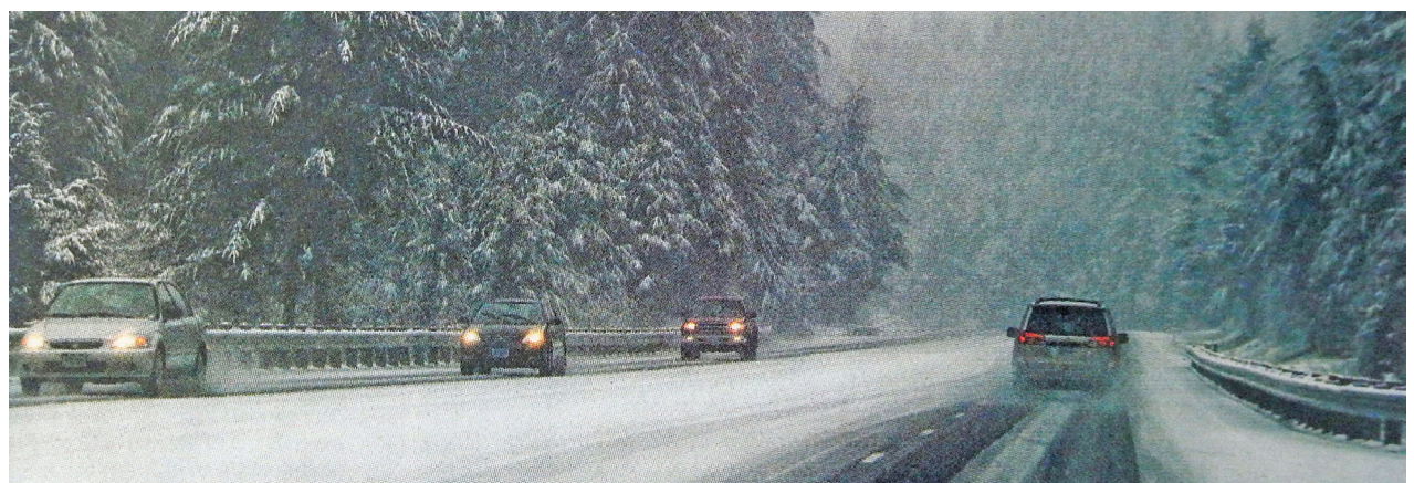
A snow-covered U.S. Highway 26 in 2010. A number of accidents were reported as a result of slippery roads.