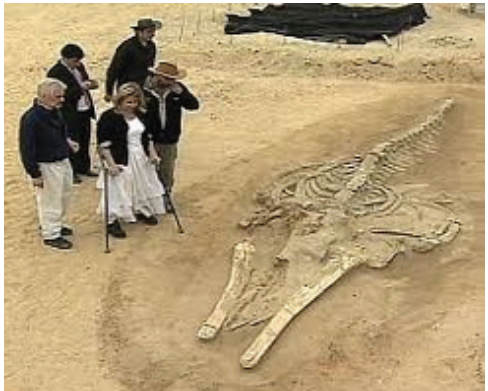
People observe a whale skeleton.

The talk will be held at the Seaside Pub-