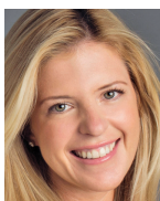
ANNIE LANE Creators Syndicate Inc.