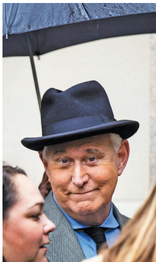
Four lawyers who prosecuted Roger Stone, pictured, quit the case after the Justice Department overruled them and said it would lower the amount of prison time for Stone.