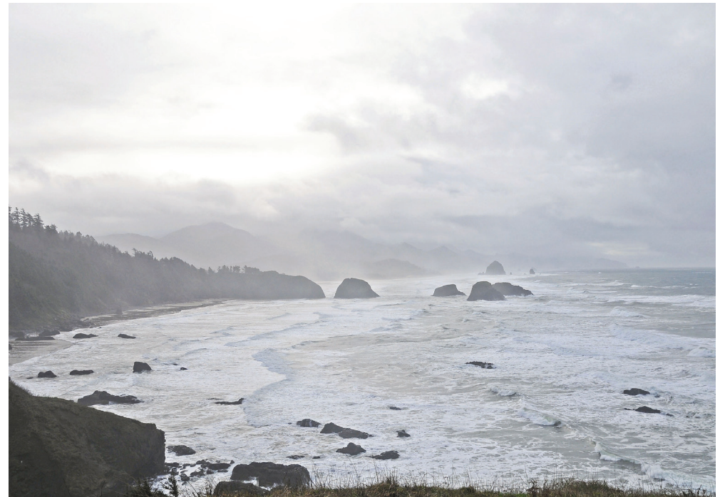
The view from Ecola Point.