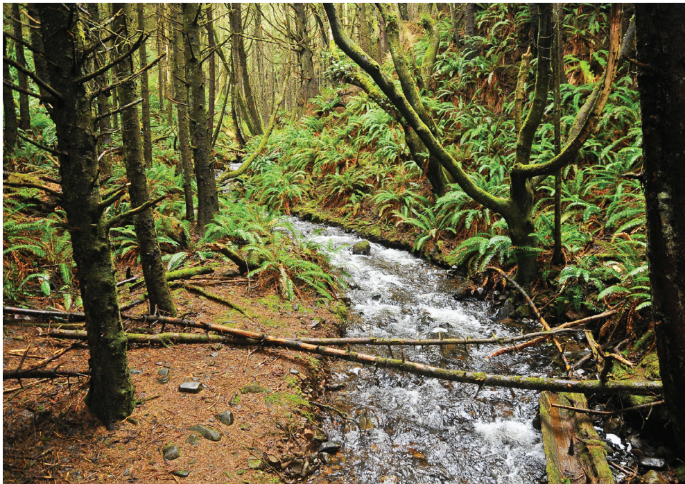
An active stream alongside the Clatsop Loop Trail.