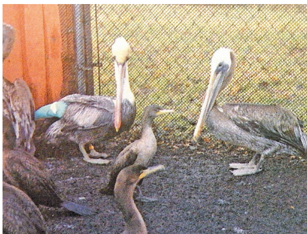
California brown pelicans recover at the Wildlife Center of the North Coast.