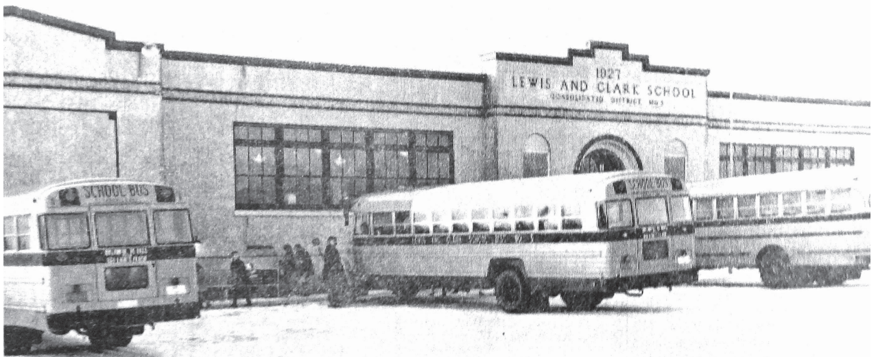
Lewis and Clark School—Involved in Proposed Merger

$5 million bond issue to finance the project. The company, whose cold storage plant is next to the proposed lagoon site, said it “enthusiastically endorses and supports” the proposed bond issue, though.