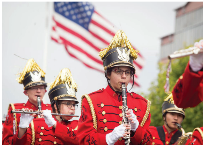
The Camas High School Band at the Loyalty Days parade last year.

Around the Vietnam War, Loyalty Day celebrations