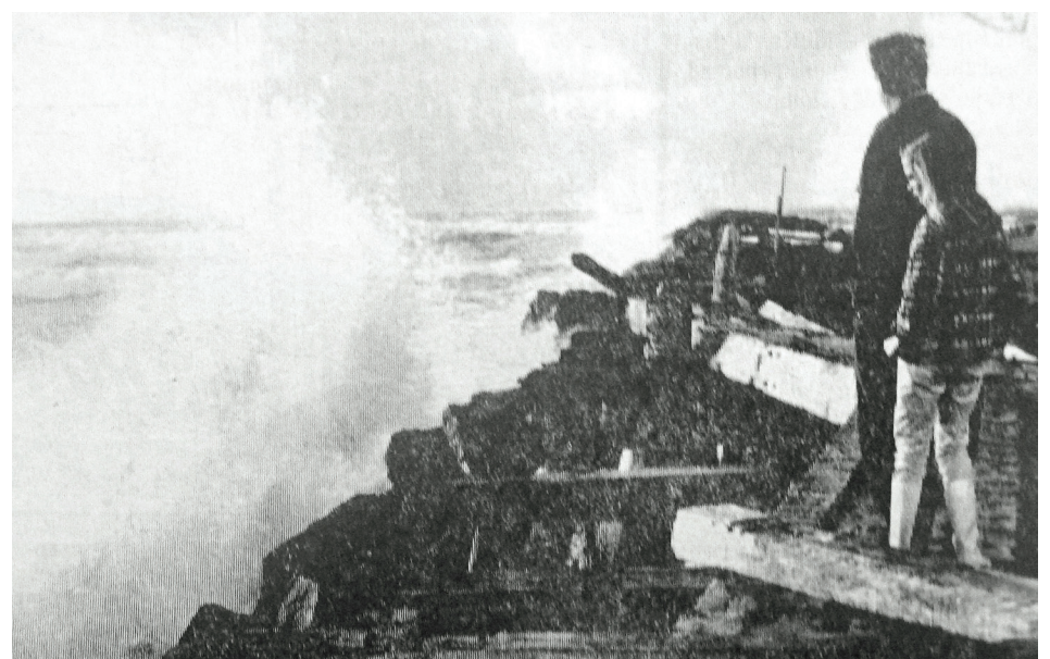
LEFT: Photographer Arno Michaelis captured a breathtaking sunrise in 2010 over the Alderbrook lagoon, drenching the snowy riverbanks in pink and orange light in his photo titled 'Global Warming.' RIGHT: Onlookers stand at the South Jetty as waves lap up at the rocks during rough seas in 1970.