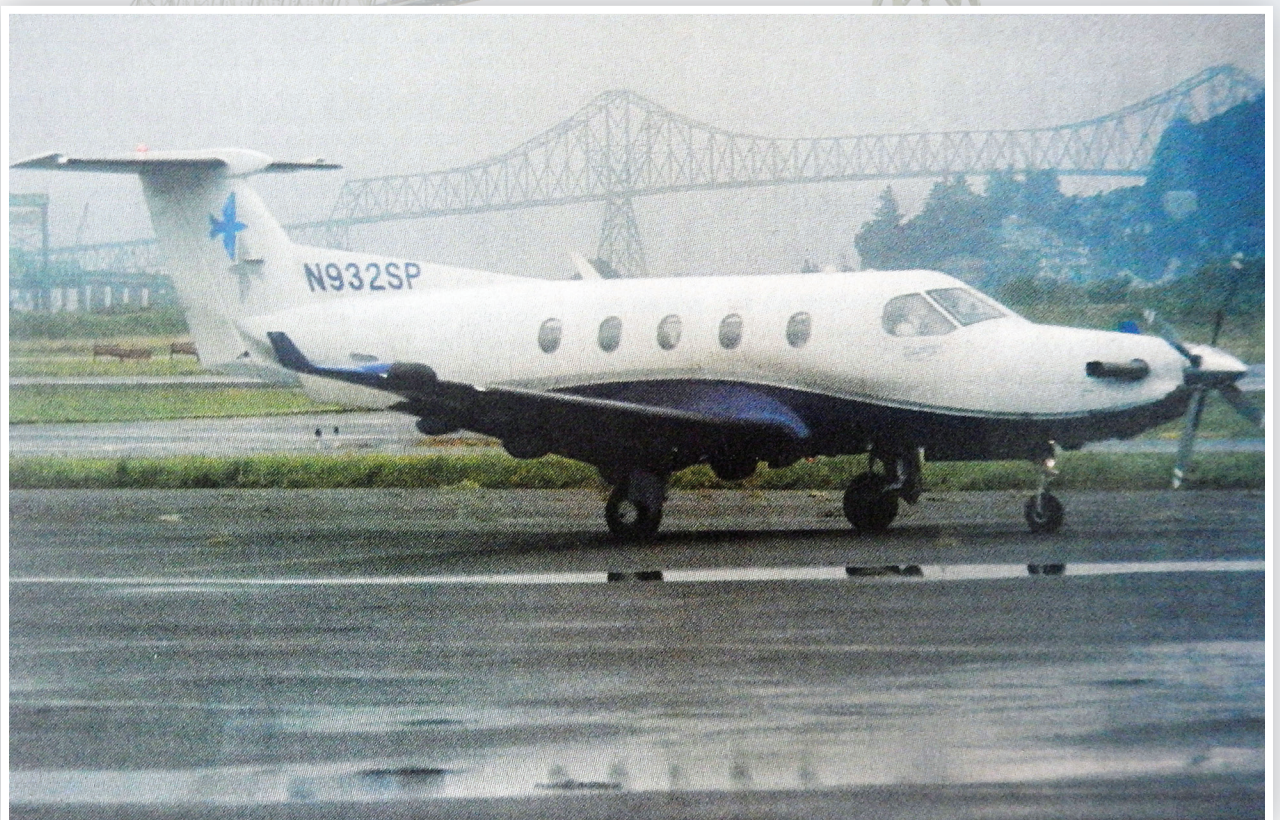
SeaPort Airlines started service to Astoria in 2010 with a ConnectOregon grant. The airline uses the Pilatus PC-12 aircraft.

The tektite will join other space-oriented displays at the museum, including a gold-plated