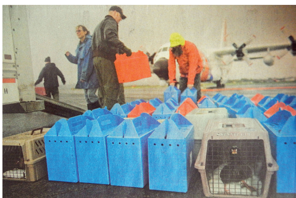
Volunteers with the Wildlife Center of the North Coast, the international bird Rescue Research Center of the North Coast, the international Bird Rescue Research Center in Fairfield, California, and members of the U.S. Coast Guard Air Station Sacramento transported more than 300 sickened seabirds, including a surf scoter, bottom right, from a U-Haul truck to an HC-130 cargo plane in 2010 at the Coast Guard's air station in Astoria.