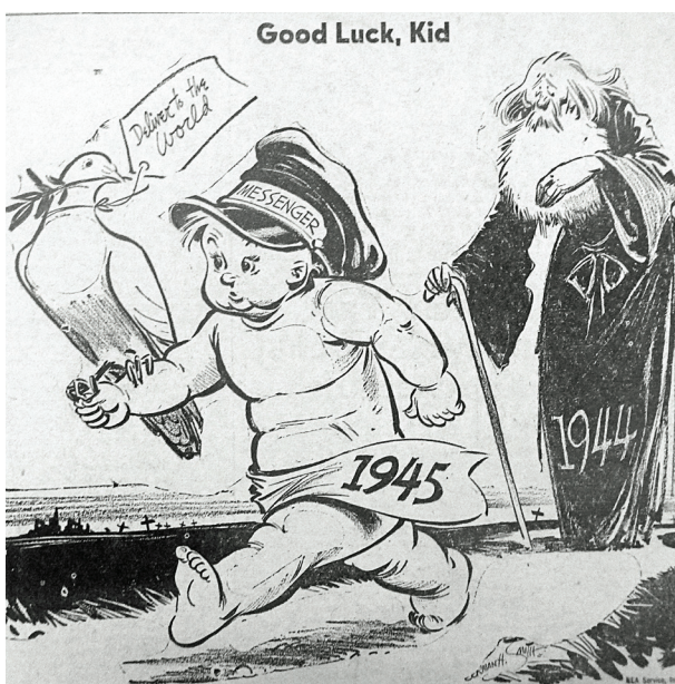
A baby New Year on his way to 1945.