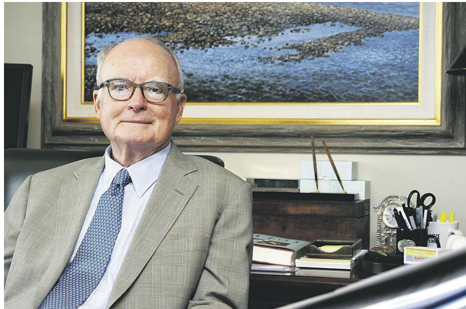
William Ruckelshaus in his Seattle office in 2011.

On the Endangered Species Act: If the law is working properly, the "how to" is an agreement by the people who will be impacted by the necessary changes. It doesn't work as well as it ought to, because a lot of time the government comes in and imposes habitat requirements that the manager of the land doesn't find completely reasonable.