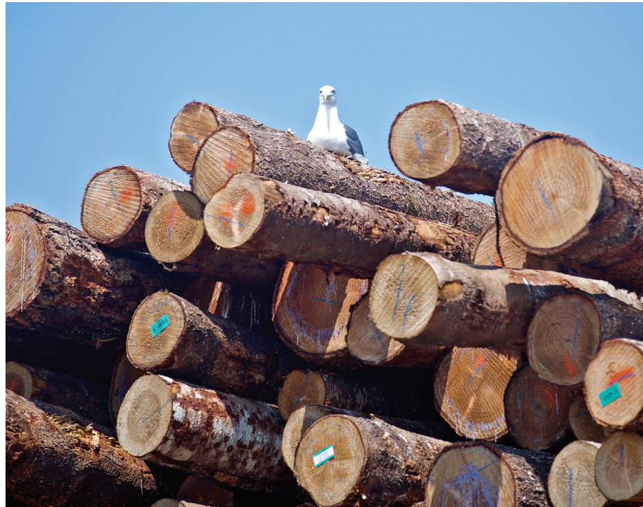
A seagull sits on top of a pile of logs at the Port of Astoria.

But log exports to China still looked like a smart bet in 2014