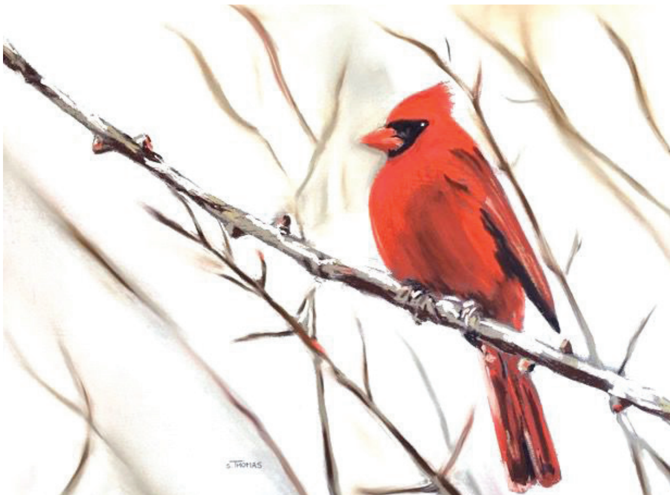
'The Chief' By Susan Thomas at A Great Gallery.

On display are original cards, hand painted boxes and tiles, fused glass, wood turned art, prints and giclées and more. Visitors will also see the newly redesigned entry and gift area which was made possible by a generous grant from the City of Gearhart.