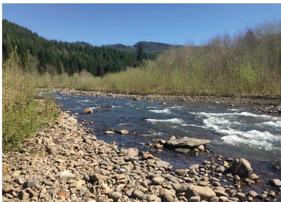
The Cowlitz Tribe is coordinating a project that will re-create more natural conditions on the South Fork Grays River in southeast Pacific County.

We are working to revise habitat standards in the state's Growth Management Act and other land use protection guidelines from one of no net loss to one