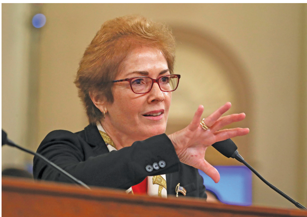
Former U.S. Ambassador to Ukraine Marie Yovanovitch testifies before the House Intelligence Committee on Capitol Hill.