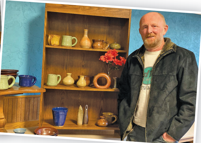
Astoria Warming Center