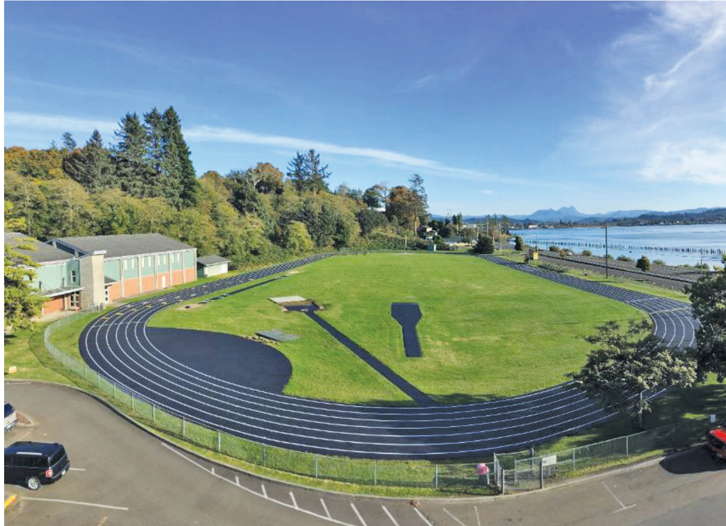
A wide angle view from overhead at Astoria High School's new track.

FRIDAY Football — Portland Christian at Knappa, 7 p.m.; Nestucca at Warrenton, 7 p.m.; Willapa Valley at Ilwaco, 7 p.m.; Taholah at Naselle, 7 p.m.