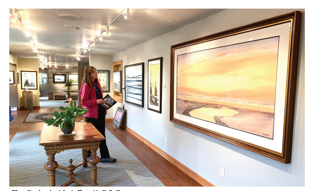
The display inside Jeffrey Hull Gallery.