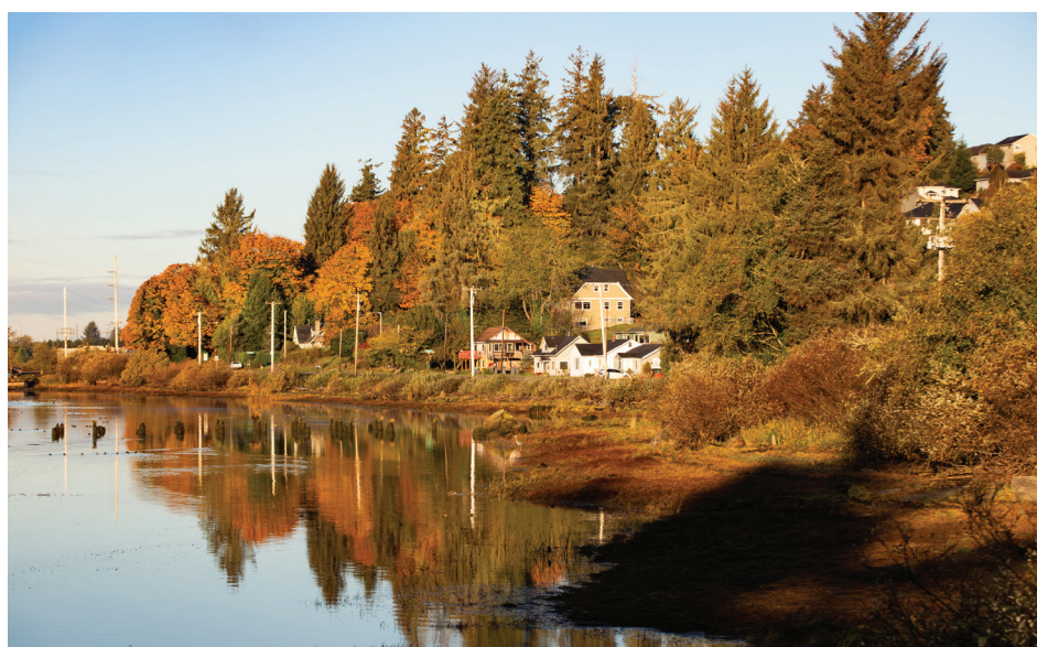
The green and yellow trees reflect off Youngs River in the golden morning light.