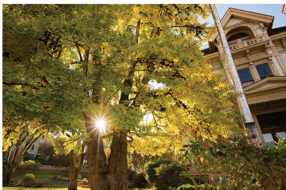
A large tree's leaves shift from green to gold outside the Flavel House Museum in Astoria.