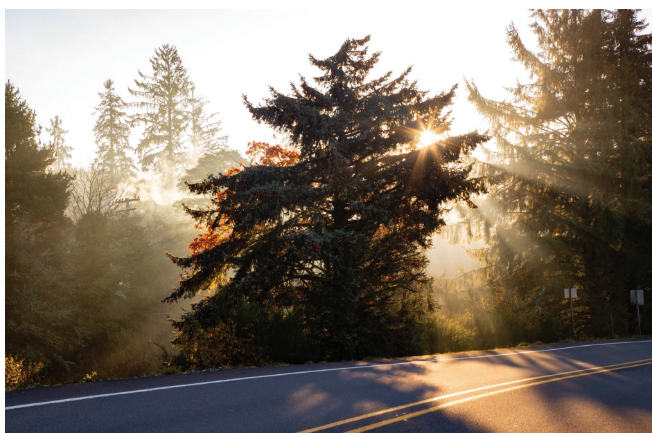
The rising sun filters through residual fog in the trees off Nehalem Highway.