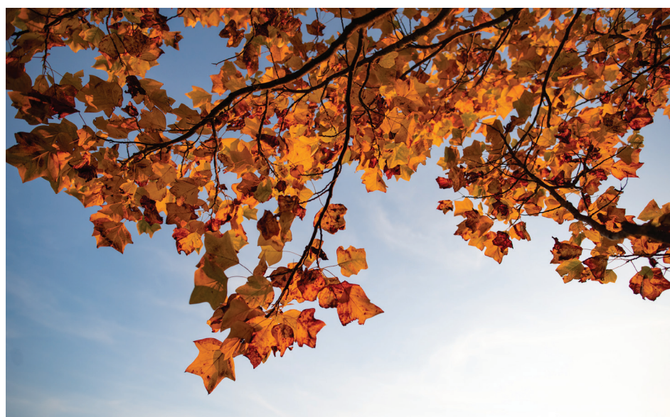
Bright orange leaves glow in the light of the setting sun.