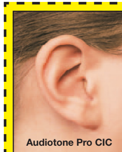
Audiotone Pro CIC

House Speaker Nancy Pelosi in response to the White House letter