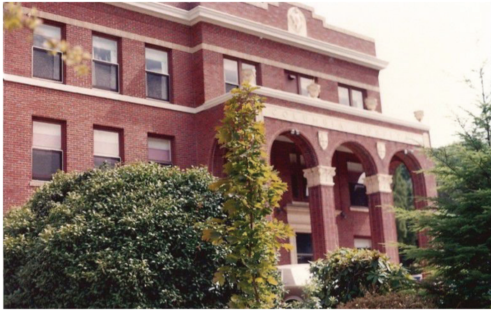
Clatsop Care Health District will hold a block party on Saturday with food, entertainment, pumpkin decorating and games.